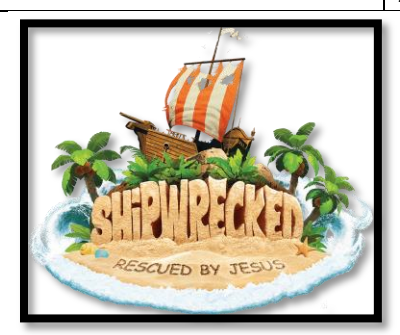
June 3-7<sup>th</sup> in the evenings 6:00-8:30pm! Register your students ASAP! We need volunteers to make this program happen – there will be signup sheets at the registration table at the back of the sanctuary.